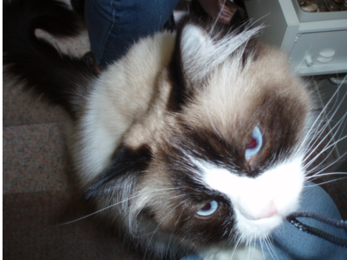
Figure 2: “I want what you’re having.”

Notice that it is possible to scale the graphic to an appropriate size. Often dumping a raw graphic into your document looks terrible because it is much larger than is appropriate. Of course one could scale the graphic file outside of L A T E X as well.